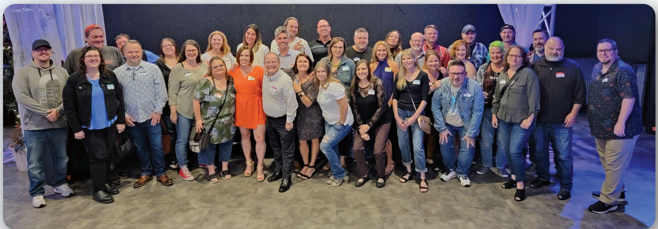
Members of the Superior High School Class of 1993 celebrate their 30th reunion and their successful creation of the Superior High School Class of 1993 Scholarship.

The "SHS Class of 1993" scholarship is not just money. It's a connection between the past and the present, a sign of solidarity among our classmates, and a source of encouragement for students who aspire to pursue higher education. As we celebrated our 30 year class reunion, we proudly celebrated awarding our first scholarship to a member of the class of 2023, helping a student achieve their academic goals.