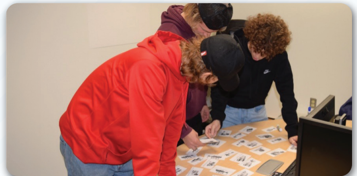
Students work to assemble the supply chain of a chocolate bar during a simulation at the University of Wisconsin-Superior during the Transportation and Logistics Career Day Experience.