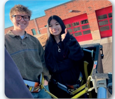
After being strapped into the bucket of the Superior Fire Department's ladder truck, students are all smiles as they prepare for a ride to the top of the ladder during the Law and Public Safety Career Day Experience.

As we continue to improve programming, the ultimate goal is for all students to attend at least once Career Experience Day during their Junior year, creating multiple opportunities for Career Clusters with high demand and interest, and adding Career Experience Days to ensure all 16 Career Clusters are represented, including some that have yet to have a Career Experience Day planned.