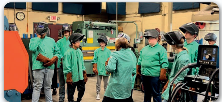
Dressed in protective welding equipment, students listen to instructions prior to trying their hand at welding during the Manufacturing event at Northwood Technical College as part of the Manufacturing Career Day Experience.